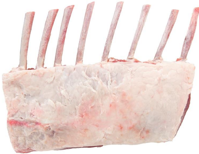
Lamb - Frenched rack