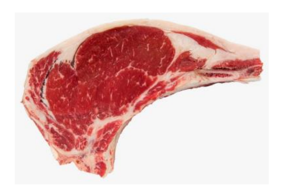
Beef - Round steak