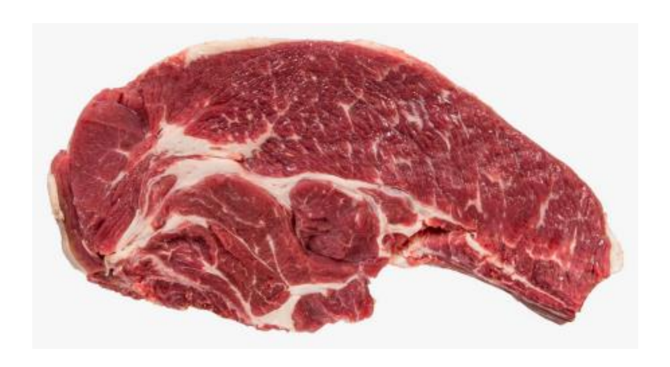
Beef - Shin beef bone in