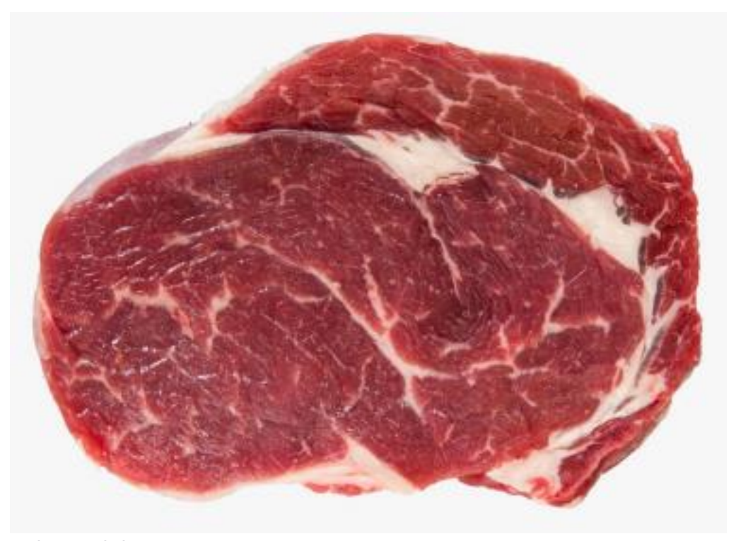
Beef - Rib steak bone in