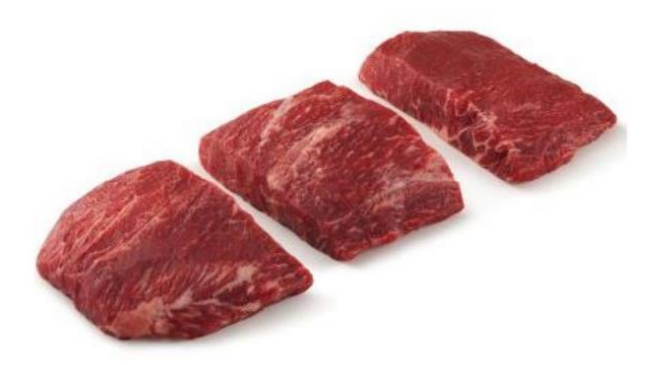
Beef – Flat iron steak