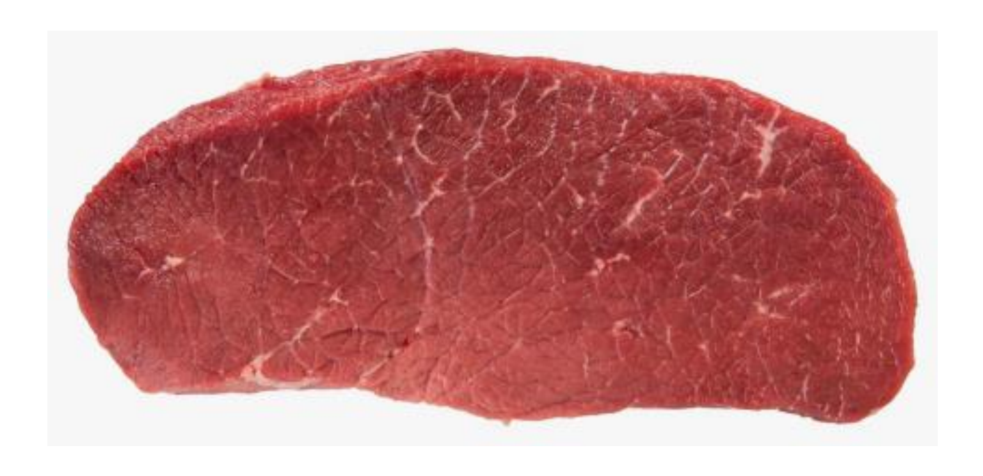
Beef - Silverside steak