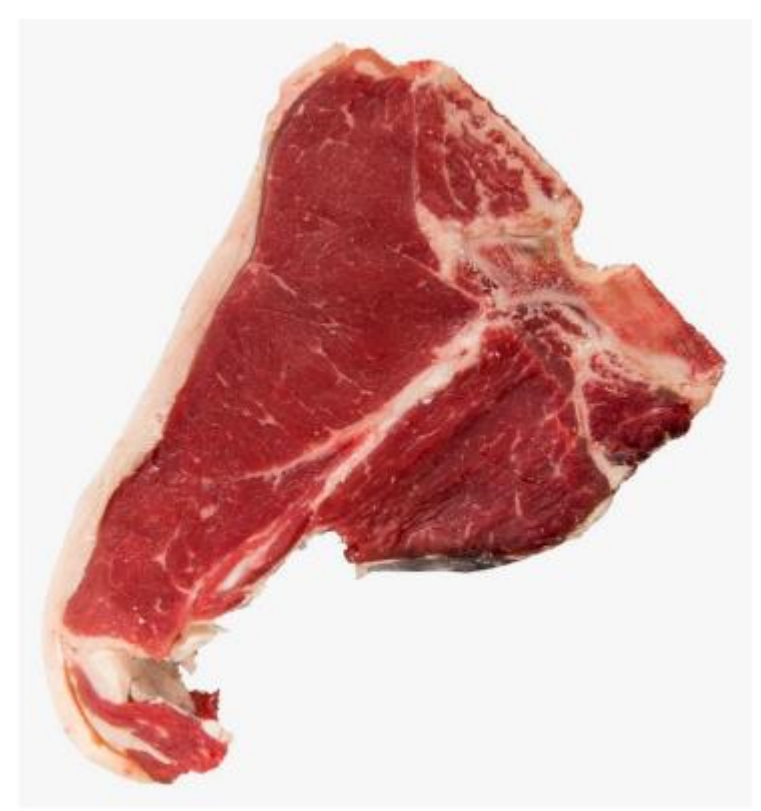
Beef - Rump cap st