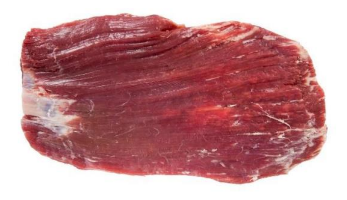
Beef – Flank steak